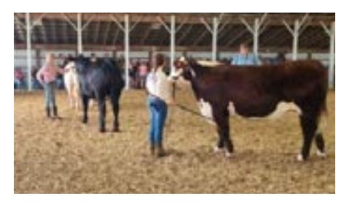
This place is dusty and dirty and it can be a little rough around the edges, but there is a lot of goodness here.

I realize you don't know I was gone, but I'm back. Had to step away to see my niece show her steer for the market class. Her first year showing and she won first place! And, as the Lord does, He made sure I was there to hear the judge telling the crowd as they waited to hear which would be named the Grand Champion steer, "this competition is not about winning or losing, it's about raising quality young people."