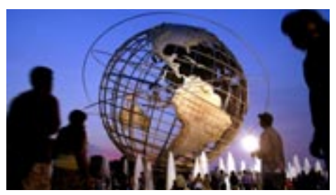
[Continued from Page 1]

owner of farmland in the United States, allowing him to control what food is – or isn't - grown. The International Energy Agency is calling for energy lockdowns, such as banning the use of cars in cities on Sundays and other restrictions on movement, just as we saw with Covid. Yet those who warn of these globalist goals are called crazy conspiracy theorists, even as these so-called "conspiracy theories" keep coming true.