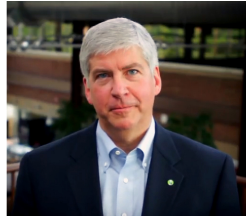
Michigan Governor Rick Snyder

ISNA is a Radical Muslim organization. Judicialwatch.org reports: “ The Islamic Society of North America is a radical Muslim organization that owns and runs mosques throughout North America, functioning as an “umbrella organization” and “clearing-house” to connect all Muslim activities in the United States. Firmly believing in, and