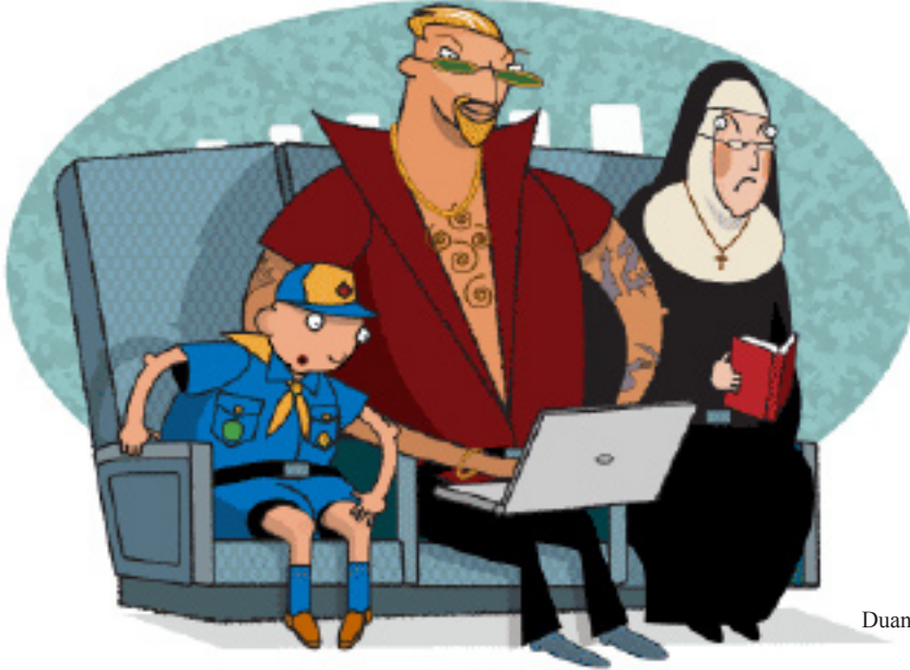
Duane Hoffmann / msnbc.com

In our October Frontline we alerted you to an issue regarding a new trend - airlines moving to provide unrestricted, unfiltered internet access to passengers on flights. Such service could lead to forced exposure to pornographic images by fellow passengers.