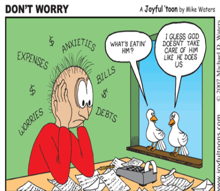
Look at the birds of the air; they do not sow or reap or store away in barns, and yet your heavenly Father feeds them. Are you not much more valuable than they? Who of you by worrying can add a single hour to his life? - MATTHEW 6:26-27 NIV

We look to Him and to His enablement. To God be the Glory for what He has done so far. May His grace continue to be upon us in this ministry and in your lives as we seek to live joyful lives in Christ Jesus!