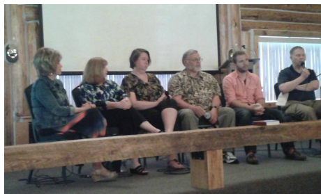
[ADA staff panel discussion]