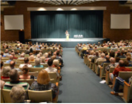
ADA Summer Conference 2013

ADA's summer conference - Friday, July 18 - 7:00 -9:30 PM