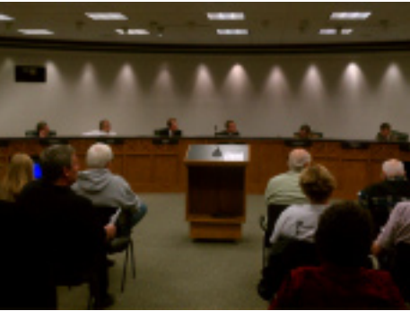
Holland City Council, June 16, 2011

HOLLAND, Mich. (NEWSCHANNEL 3) - The Holland City Council has made a decision on a controversial issue that was a year in the making.