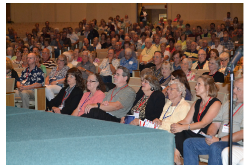
"Truth for Our Times" Conference Audience

American Decency Frontline Vol. XXVII, Issue VIII Published monthly by American Decency Association