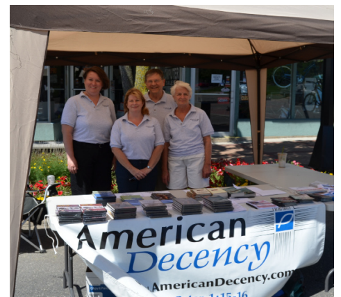
Part of our team having a presence at Fremont's Gerber Baby Food Festival

Only that I and ADA would have open eyes as we try to follow God's leading.