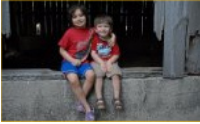
Grandkids enjoying some time in the barn - spring 2010

Recently, I was reading children's Bible stories to two of my grandchildren. As I would finish one story, they would ask me to go to another until we came to the story of David and Goliath. It was so special to see how enamored they were with these classic Bible accounts.